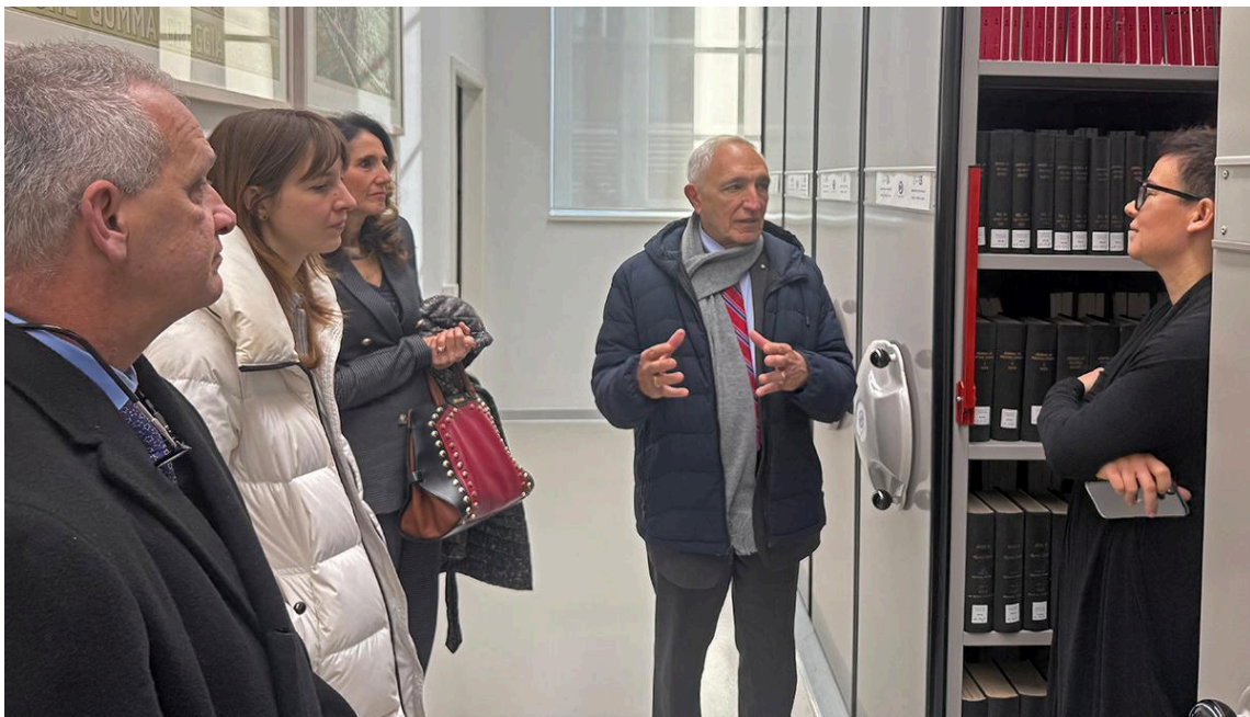
OSDIA leadership during a tour of Fondazione Pirelli, which focuses on archiving and showcasing the history of the Pirelli brand (January 14th, 2025).